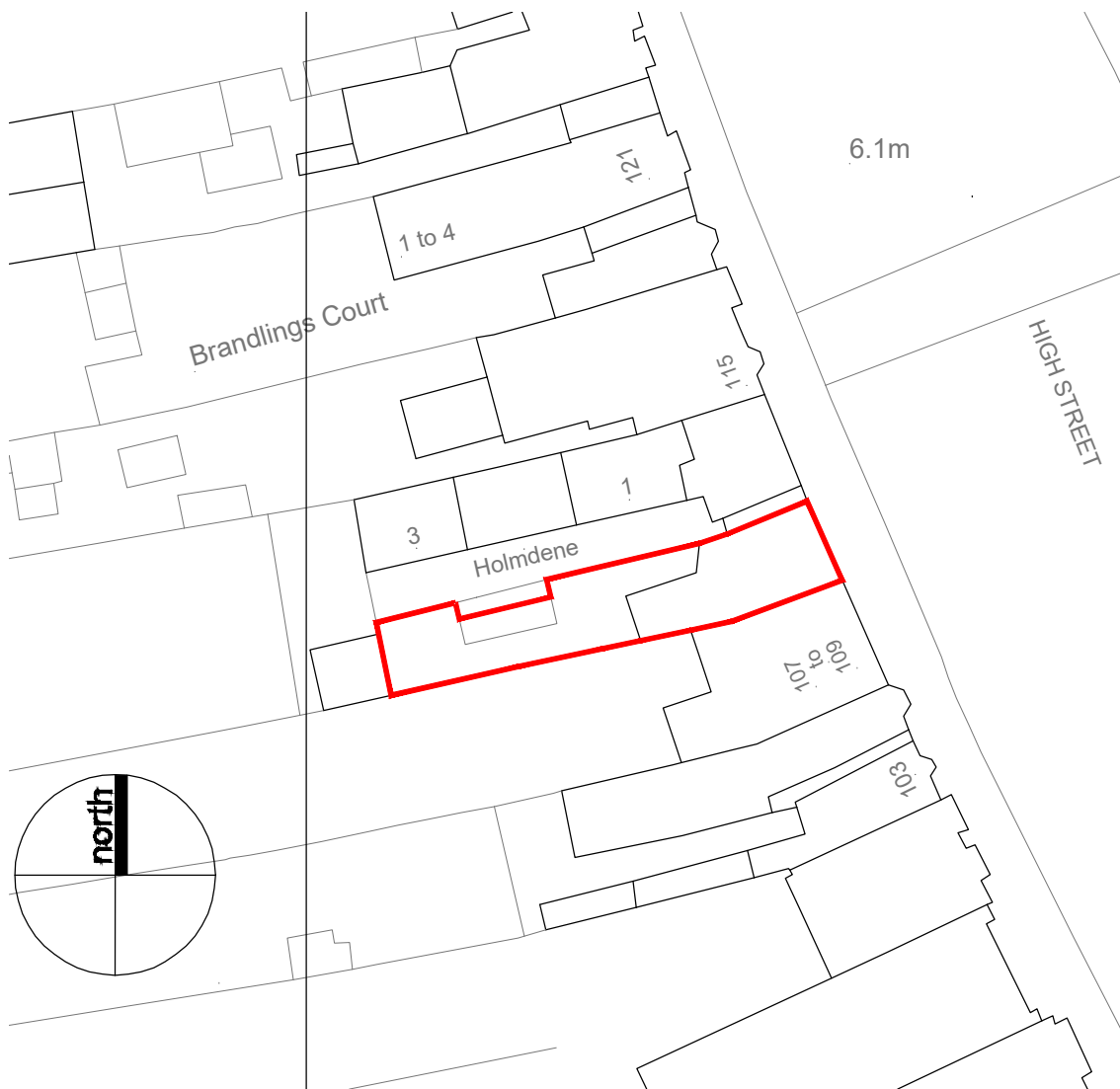
EXISTING BLOCK PLAN - SCALE : 1:250@A1 1:500@A3